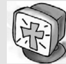
Photo Albums — Sermon Library