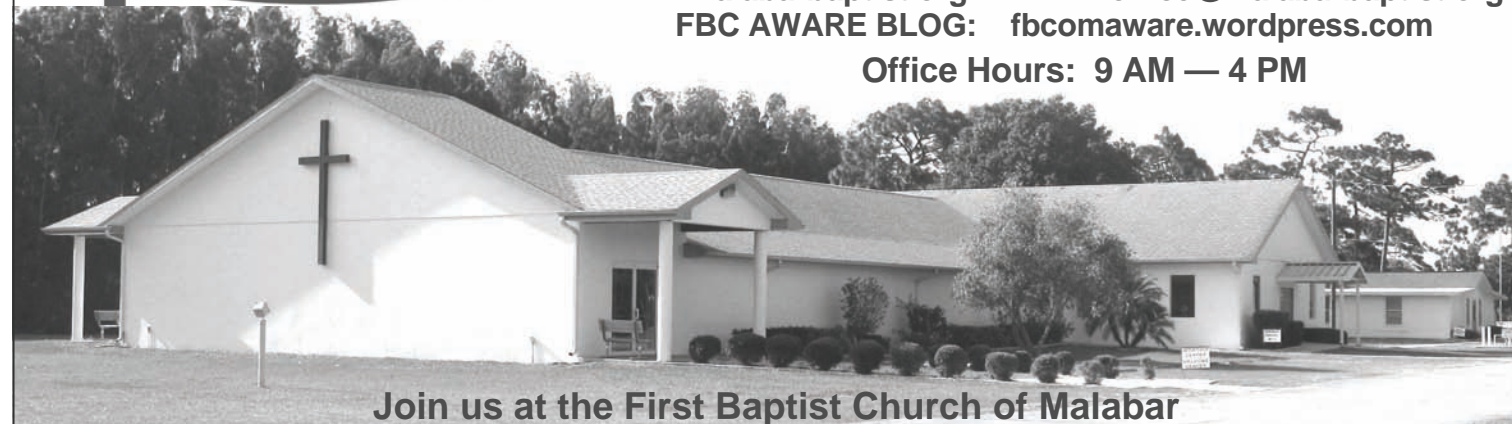
Join us at the First Baptist Church of Malabar