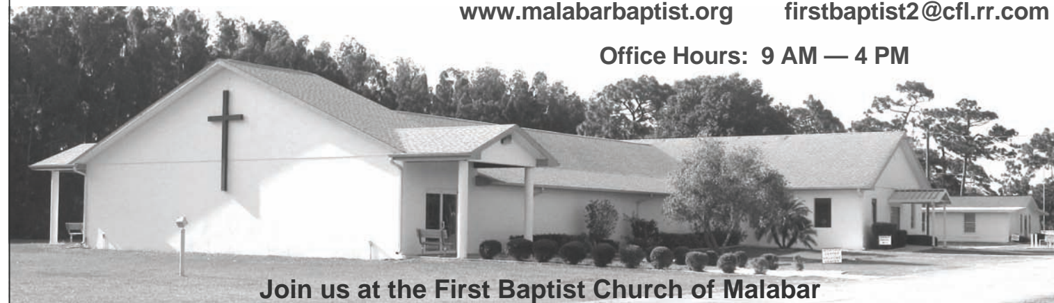
Join us at the First Baptist Church of Malabar